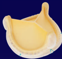
Avalus Ultra™ bioprosthesis

Fit for the f uture right from the start. A man in a red long-sleeved shirt and khaki shorts stands with his back to the camera, arms raised in a 'V' shape, on a wooden pier overlooking a body of water at sunset. The word 'future' is written in large white letters, with the letter 'u' highlighted in a teal color that matches the circular graphic in the top right.